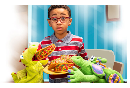
Dragons Love Tacos!

Playhouse in the Park - FREE for viewing April 23-25. Pre-register HERE.