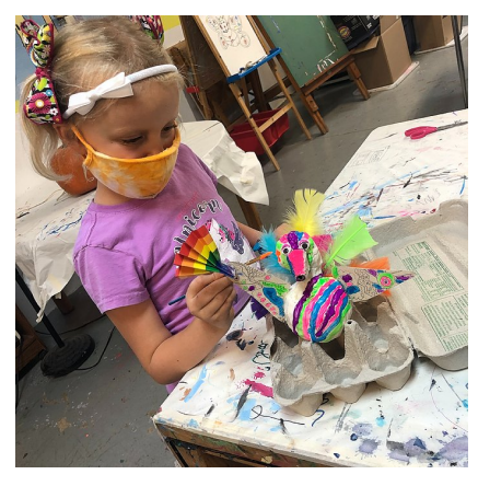
On Friday, March 12th and March 19th, The Center will be open to help support remote learning.

The Loving Wyoming Program is in full swing. You can sign up for individual classes as well as apply to participate in the Art Exhibition in June. Please find the program dates <u>HERE</u> and the application HERE