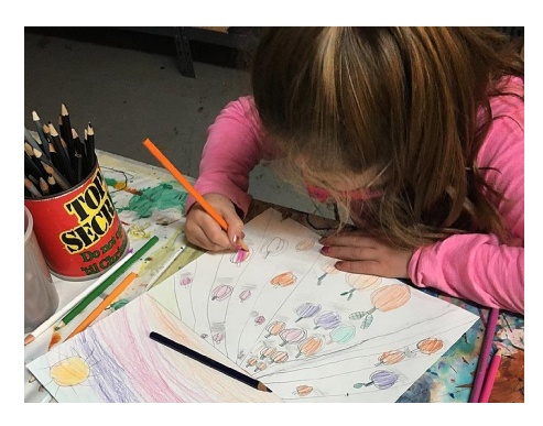
No School? Let's Art!- Friday April 10th.